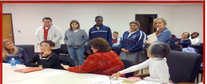
Four of the 2009 Students and their parents are introduced at the October meeting ! Have fun!